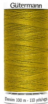
Denim 100 m - 110 yds/vgs